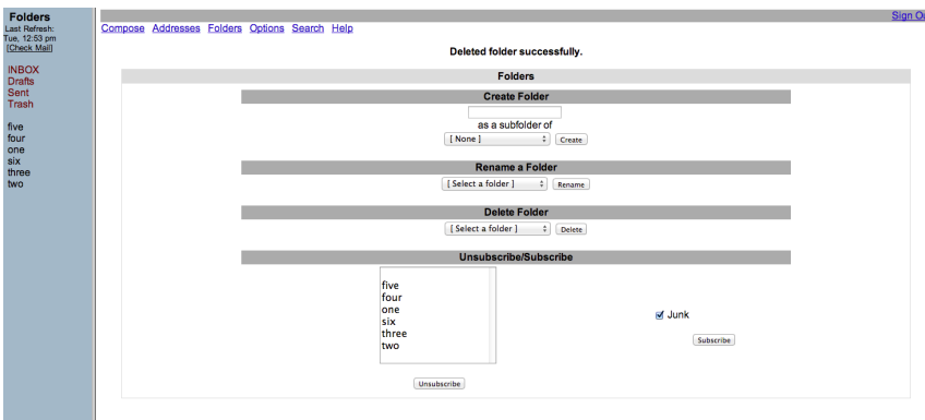
The SquirrelMail interface